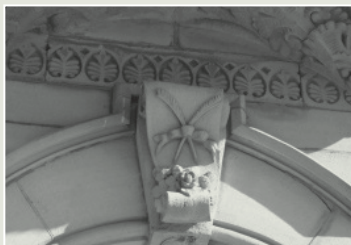
The crossed quills, symbol of a centre of writing