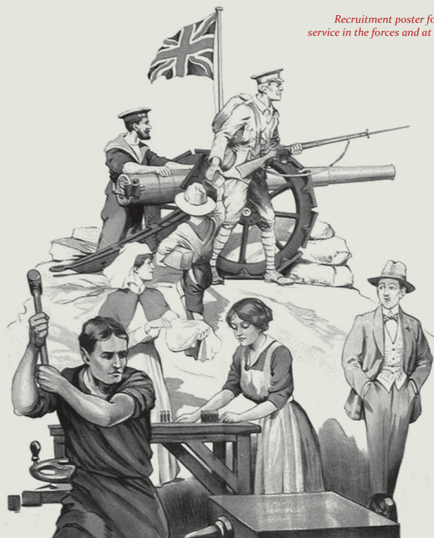
Recruitment poster for war service in the forces and at home