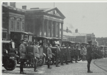
Motor Volunteers and official ambulances await a convoy of 100 wounded soldiers

Discover Huddersfield offers new ways to experience this amazing Yorkshire town, through guided walks, talks and trails. See Huddersfield at its very best: grand listed buildings and small independent shops; a place for radicals from the Luddites to the Sex Pistols; birthplace of Rugby League; a town rich in creativity, stories, heritage and the odd ghostly encounter.